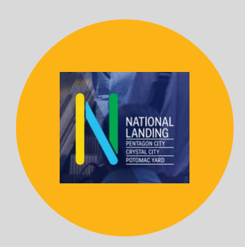
Mobility Next - National Landing BID Report